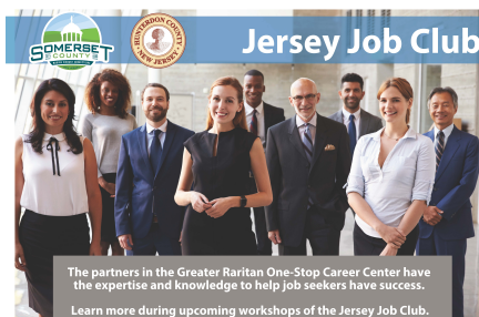
The partners in the Greater Raritan One-Stop Career Center have the expertise and knowledge to help job seekers have success. Learn more during upcoming workshops of the Jersey Job Club.

The Greater Raritan One-Stop Career Center in Somerville has resumed hosting a series of monthly Jersey Job Club Workshops. These workshops are virtual, through Zoom, along with a limited number of seats for in-person attendance at the One-Stop Career Center, 75 Veterans Memorial Drive, Somerville. The career-centered workshops are free to attend. Call 908-704-3000 or visit the calendar page of www.thegrwdb.org for registration details.